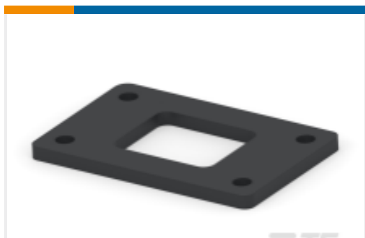
TE Part #DT8P-L012-GKT GASKET, 8P, BLK, DT/DTM