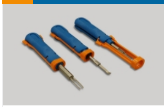
Insertion & Extraction Tools(3)