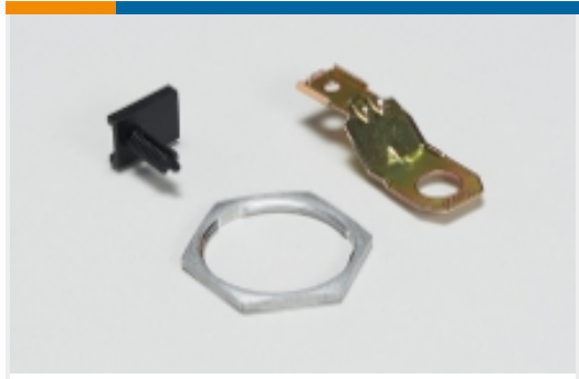
Other Automotive Connector Accessories(28)