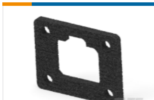
TE Part #DT4P-L012-GKT GASKET, 4P, BLK, DT/DTM