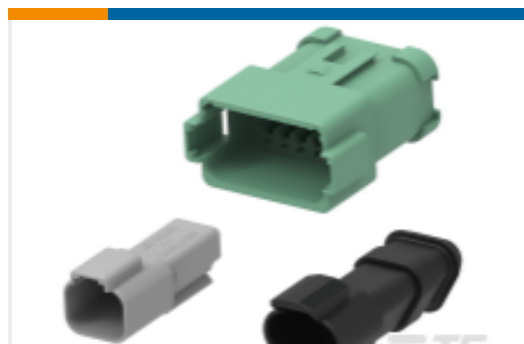
TE Part #DT04-12PB-L012 DEUTSCH DT Receptacle Connectors