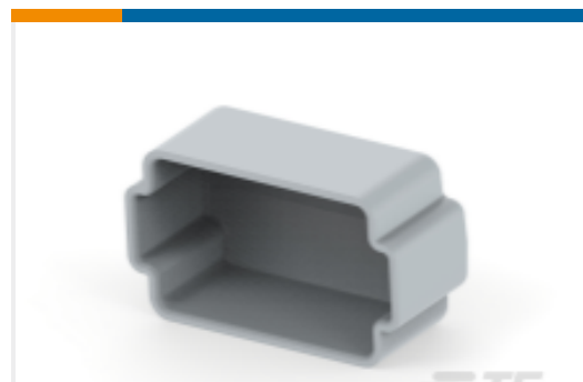
TE Part #DT12P-DC PROTECT CVR, 12P, REC, GRY, DT