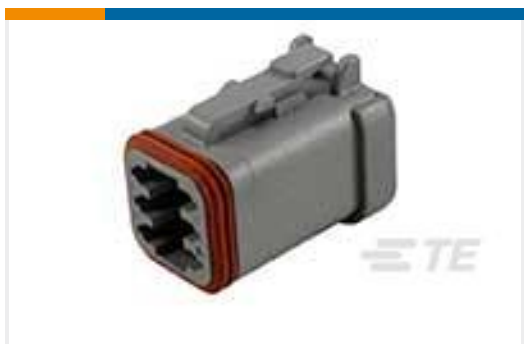
TE Part #DT06-6S-EP04 PLG, 6P, GRY, N, CAP