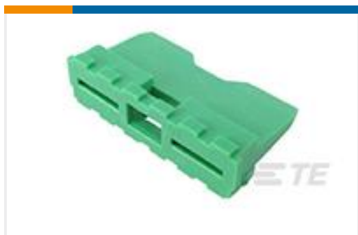
TE Part #W12P WEDGE LOCK, 12P, REC, GRN, DT