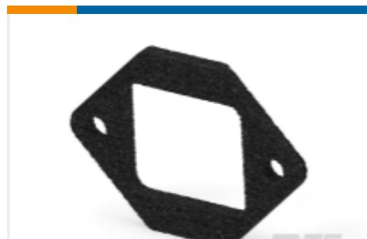
TE Part #DTP4P-L012-GKT GASKET, 4P, BLK, DTP