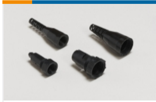
Connector Strain Relief(28)