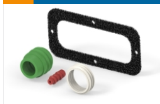
Connector Seals & Cavity Plugs(9)