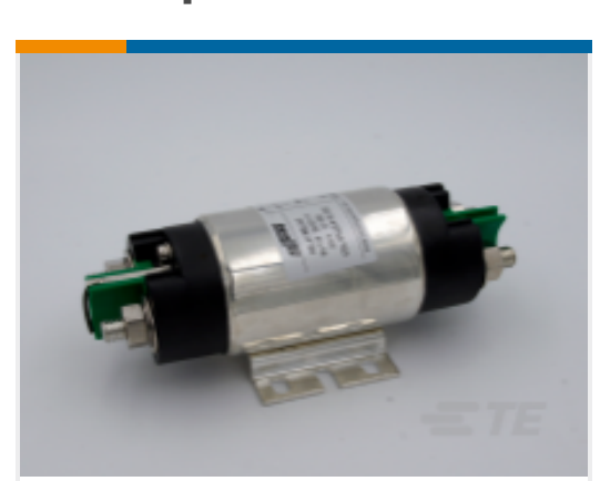
TE Part # CAT-AL6-KSPR29200 Power Relay, 200A, Standard, Monostable, DC